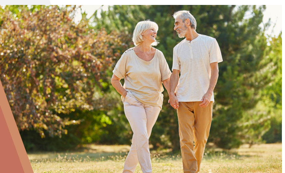
IMPROVING PEOPLE'S LIVES

Chronic Care Management is a comprehensive healthcare program designed to support individuals living with long-term medical conditions. At its core, CCM aims to enhance your overall well-being by providing a tailored approach to managing your health and improving your quality of life.